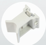
Mounting pole bracket