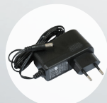
24V 0.38A Adapter