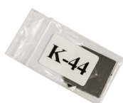
K-44 mount kit